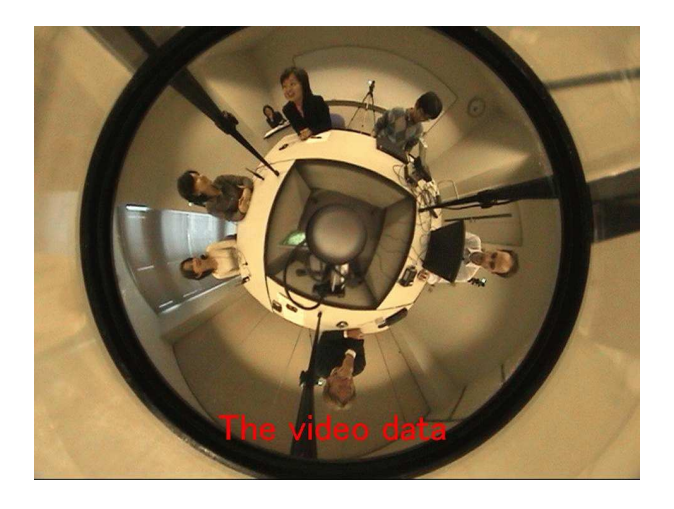
Figure 1: A 360-degree camera provides a view of all participants at the meeting, and although the resolution is low, their body movements can be tracked using skin-tone-sensitive image processing algorithms (see fig 3)

We are testing 2 miniature professional cameras in addition to a high-end domestic quality cam-corder (Sony DCR-HC1000) for video capture. The cam-corder would allow us ultimately to provide a cheaper version of the technology, but we have not yet succeeded in realising good image-detection from this source, which is currently regarded as a back-up device to facilitate record-keeping and subsequent human labelling of the video data, having its own integral sound with 2 or 4-track recording.