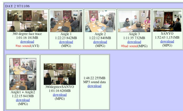
Figure 2: following the Video & Audio data link ... showing the files available for day 2 of the recordings.

n y d k n 0.56 0.95 @w (laugh) y 4.52 10.96 "hum...most of story of Manzai .. " y 11.41 14.87 "but in Manzai ... like" k 14.2 14.52 hum