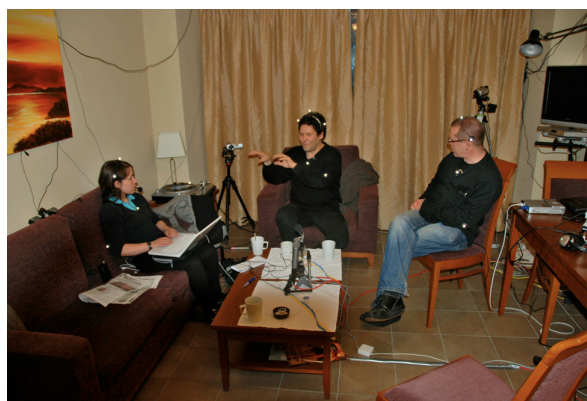
Figure 1: The apartment room in which all recording was conducted.

The D64 Multimodal Conversational Corpus has been designed to collect data that transcends many of these limitations. It has been designed to be as close to an ethological observation of conversational behavior as technological demands permit (see also Douglas-Cowie et al., 2007). We first outline the recording setup, the planned model of distribution, and finally, some of our initial aspirations in the analysis of the rich data that results.