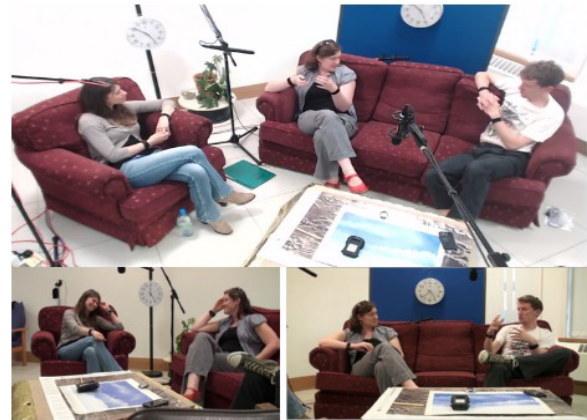
Figure 2: Three camera angles: global overview on top, chair cam bottom left, and sofa cam bottom right

Three video camera angles were recorded, as illustrated in figure 2.