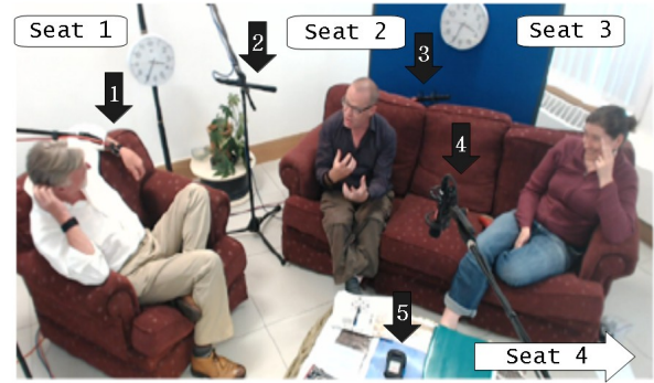
Figure 1: The informal conversational space used with seat positions and microphones labeled.

For the purpose of informed consent, basic information was provided regarding the biosensors and recording equipment, but no direction was given regarding the structure or objective of the interaction other than to sit down and “chat.”